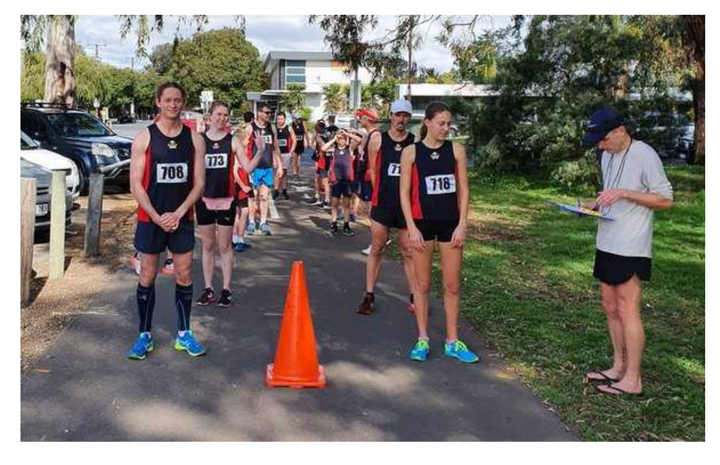
Walkers get ready for their turn in the annual SARWC Guess Your Time Races