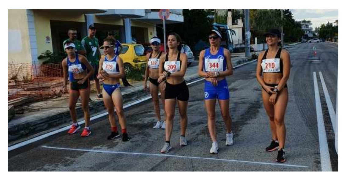
The women on the start line