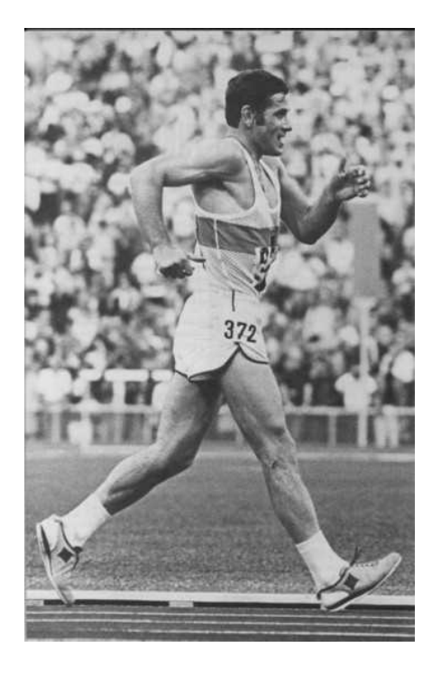
Kannenberg storms up the finishing straight to win the 1972 Olympic 50 km event – one of walking's most famous photos