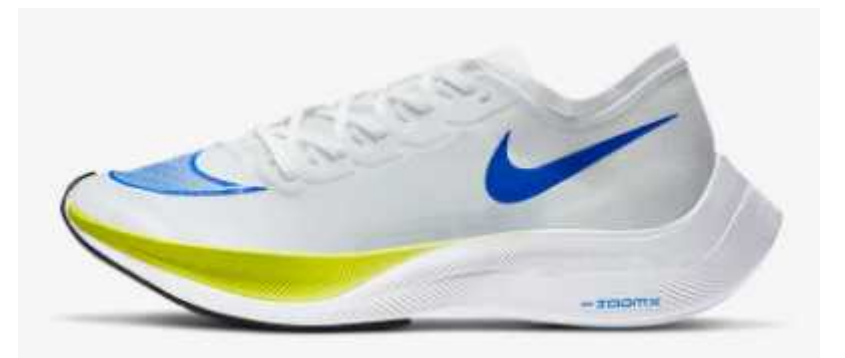
Nike Air Zoom Vaporfly - the first sub-2-hour marathon

In recent years, professional cycling has seen huge improvements in bike design, via steamlining, light weight materials, etc. Swimming also experienced a similar seismic shift in performance when high-technology swimwear was designed to reduce drag and improve swimming performance - so much so that eventually full body swim suits had to be banned from major competition. Now running is experiencing that same seismic shift in performance as a result of advances in shoe design. A revolutionary new road running shoe design has led to the first sub-2-hour marathon, while a revolutionally new spike design has led to a plethora of new track based running records over distances which include 10,000m track, 5,000m track and 1 Hour track.