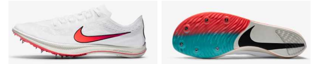
Nike ZoomX Dragonfly spikes, billed as the "fastest shoes ever".