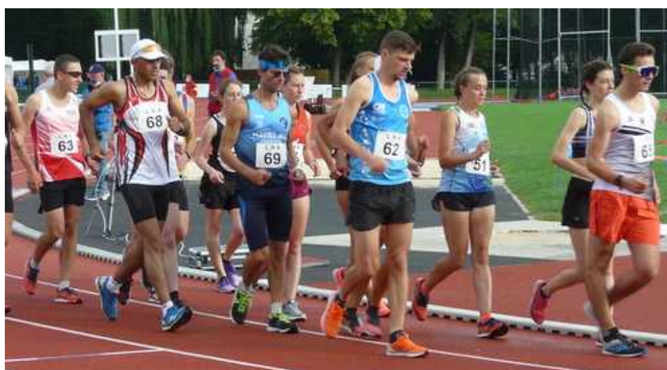
Walkers get underway in Caen