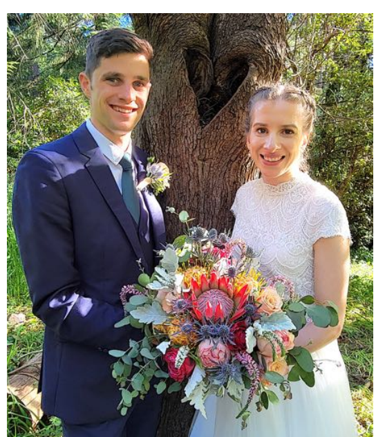
A lovely day for a lovely couple.