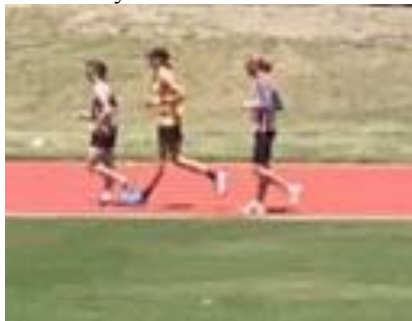
A battle of Wills'

It was on from the starters gun, with the lead between two changing often and each taking turns to not let the other break away from a catchable distance.