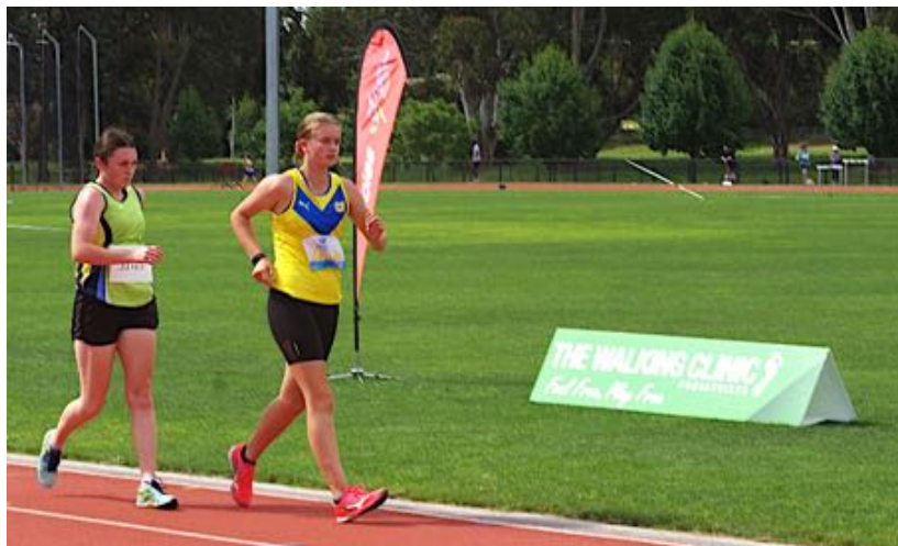
North v South action at Woden Park

** Being the last event for 2021 we now look to the 2022 calendar.