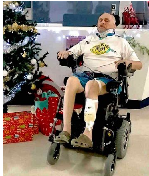
At the Austin spinal unit, 12 December ... ready to go places.

During his period in the Austin's ICU and spinal unit, one thing that has especially given him cheer and encouragement has been hearing the many messages of hope and support from extended family, friends, club-mates (VRWC, Athletics Victoria and the Landrover Club, among others). He has much appreciated these, and knowing those vital contacts are still there is an essential factor in his recovery. It's important that these communications continue. Please keep them coming. (Send to stuwalks@yahoo.com.au ) Visiting, however, is for the future, and members will be informed at the earliest opportunity when this is appropriate.