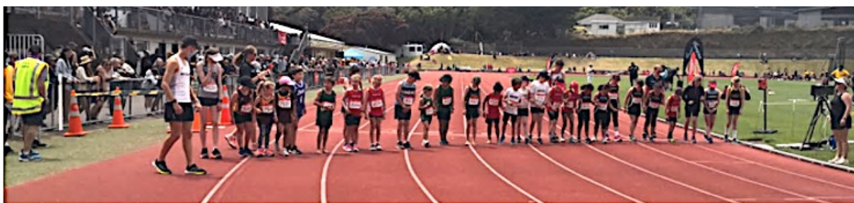
Getting ready for their first attempt at race walking