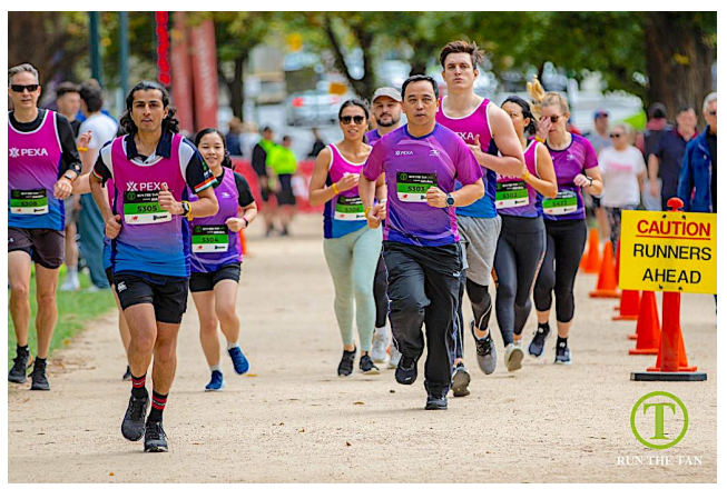
Let's get some walkers in amongst this lot!