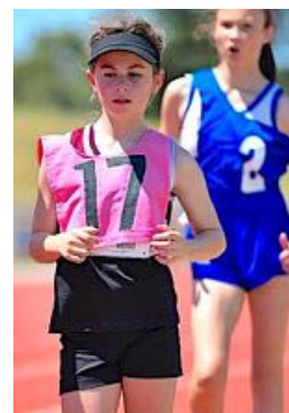
Matilda leading at Traralgon.

Well done, girls, and the best of luck to you all in the State titles coming up.