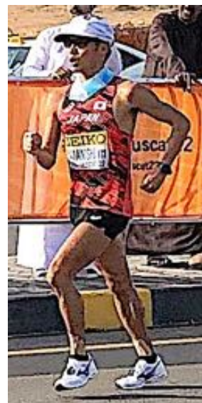
Yamanishi – total dominance