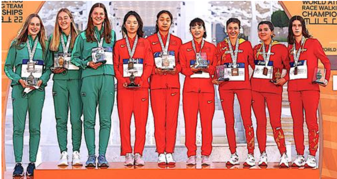
Women's U20 podium - Australia 2 nd , China 1 st , Spain 3 rd