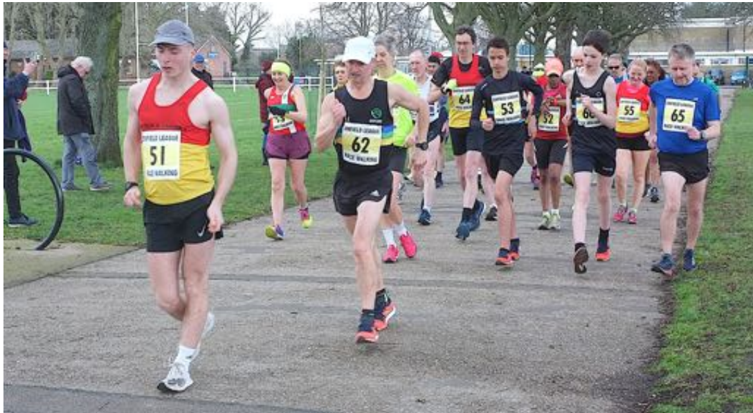
Underway at Enfield