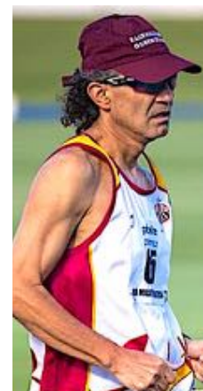
(Photo of Mark Blackwood courtesy Therese Smith. Photo of Ignacio Jiminez Solis courtesy benfraserphotography.net)

Well done, Mark and Iggy. You're both standard bearers for older athletes everywhere.