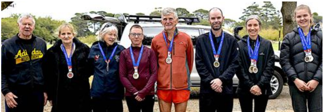
Nice to see he didn't hand them out as hard as he went after them!