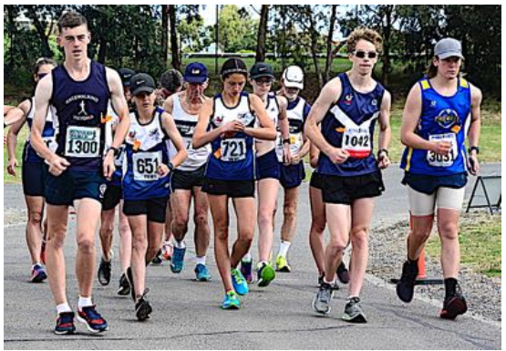
Legal race starts at Middle Park. (How many 'great leaps forward' can you see here?)

FINISHING: A walker's all-out effort to beat an opponent or gain a desired time will sometimes cause them to lose control of their technique, and forget their rule compliance. Often we see a walker desperately fling themselves over the line with a final 'leap', like a runner lunging at the tape. (Anyone remember tapes?) If the walker is off the ground when they make that lunge – Red card. (Or worse if they face a Chief judge qualified to DQ them in the last 100 metres. Not good.)