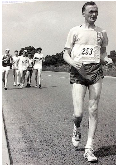
The man to beat

He had success with the Sarnia Walking Club in 1967 leading the field home in the prestigious Garnet Cup over 10 miles in which the club gained first place in the team section.