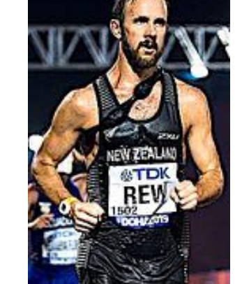
Q racing in Doha, 2019