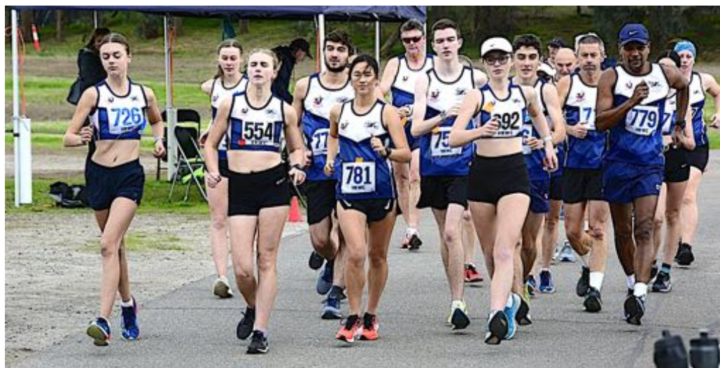
Underway at Middle Park – all keen to stay warm!

VRWC Club points races #4, Saturday 4 June – Middle Park