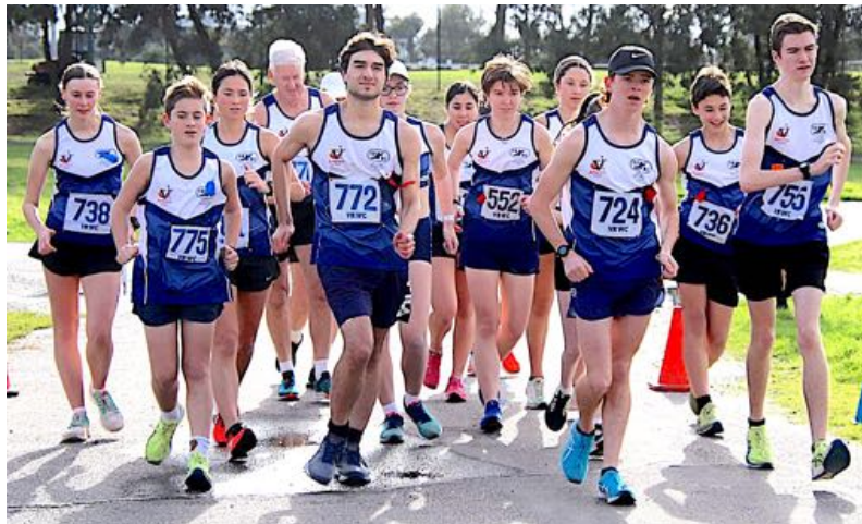
A big, keen bunch starts the first interval ...