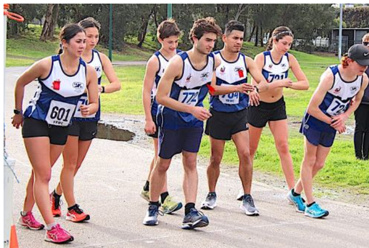
A smaller one starts the 5 th . ("Let's get it over with, guys.")