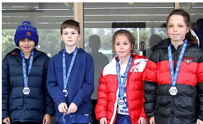
VRWC U10 2km