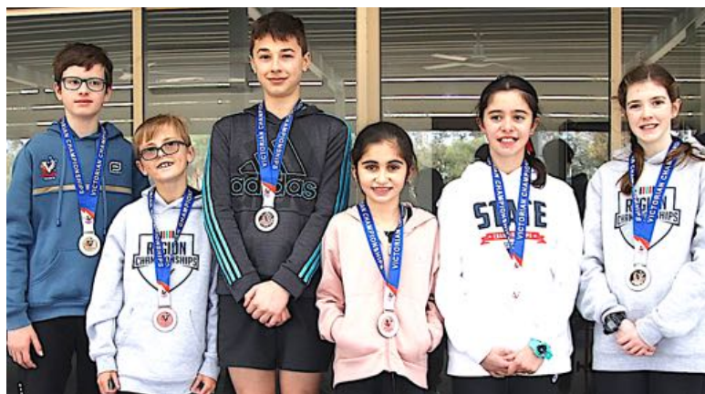
AV U14 3km