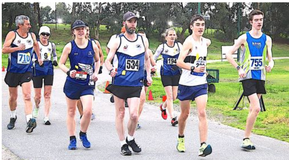
The AV U20/U18 and VRWC 10km gets underway

It was regrettable to see nobody entered for this season's distance championship, the 30km, in either the AV or VRWC divisions. It's a sorry fact that, with demands on our time and energies increasing and our appetites for long-distance races (along with opportunities to train for them) diminishing accordingly, races like the 30 have become a threatened species almost everywhere ... at club level, at least.