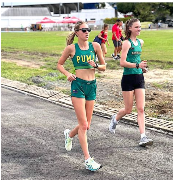
First training session in Cali ... at the jumps track.