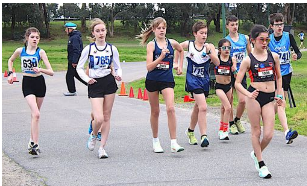
It's the U14's turn ... 3 windy kms await.