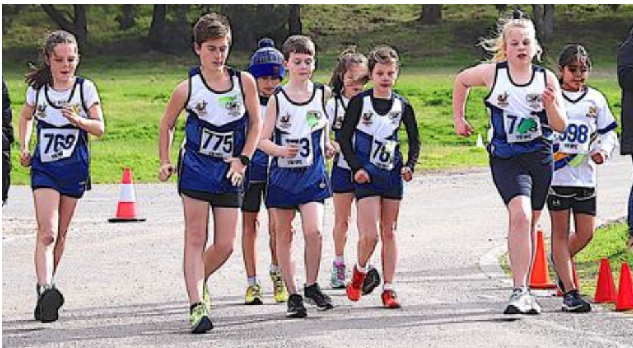
The VRWC 2km championships field sets off.