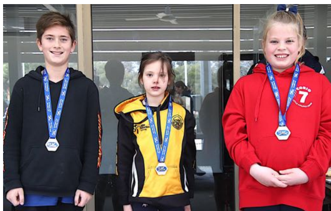
VRWC U12 2km