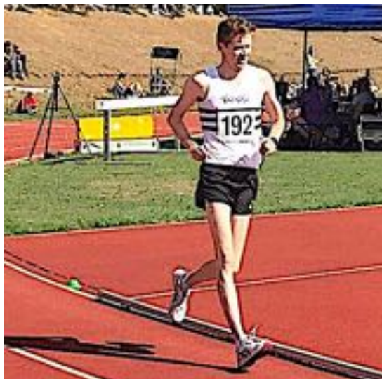
... and finishing there: 3000m in 11:41:18.