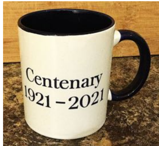
Who said race walking wasn't a mug's game?