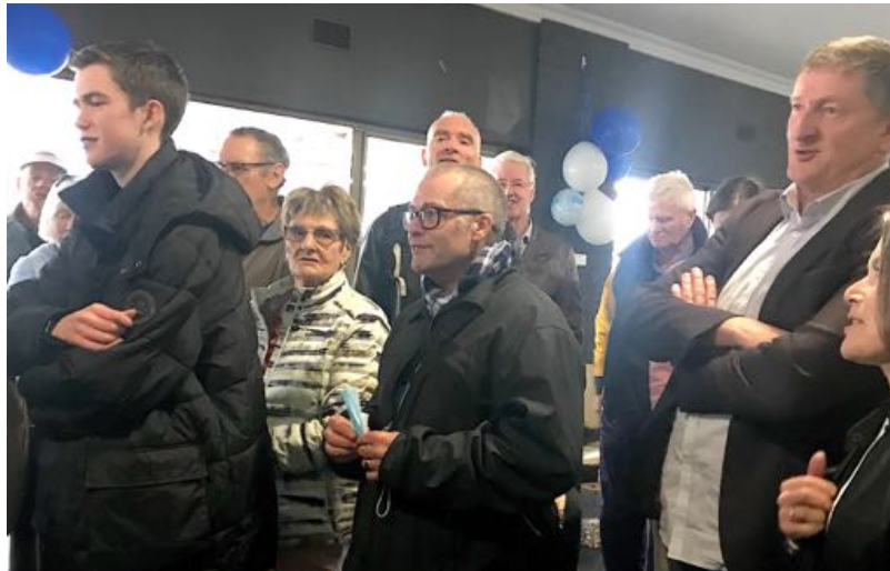
A hungry, happy lot, waiting for lunch