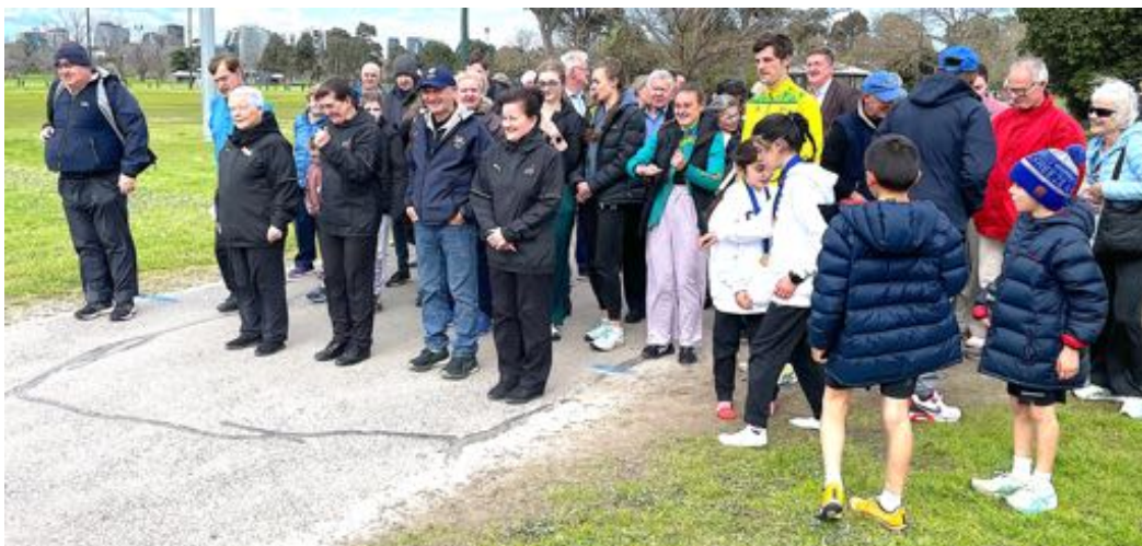
The Cake Walk. The judges, on the line, went first (some dodgy technique there, folks!)