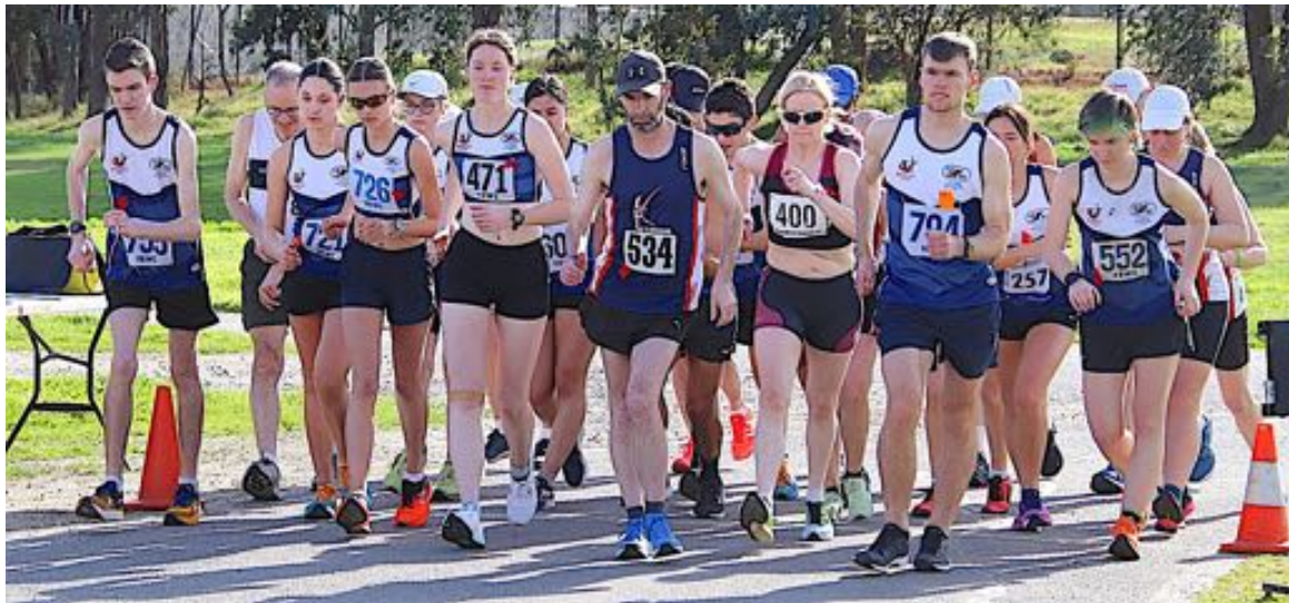
They're underway in the 10km and 8km.