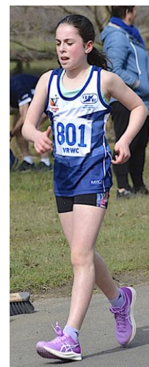
The VRWC (and TRWC) colours fly at Victoria Park.