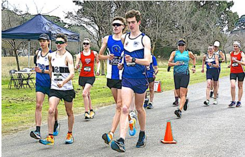
Nothing like a 10k to get the blood racing on a Ballarat morning ...