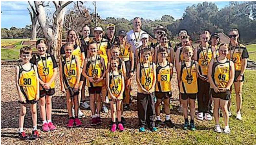
Sunny day, sunny dispositions ... happy WARWC medallists.

Results courtesy of Terry Jones , who reports that the weather was a classical Perth spring day for the Club championships – sunny, calm and ideal for a stroll in the park, though possibly a little warm for competitors not being used to the unusual warmth at that time of the morning.