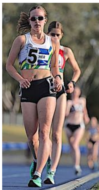
Sienna strides to U16 gold ...