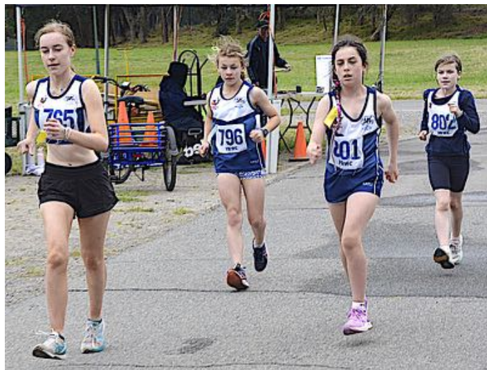
The 'mosquito fleet' takes off.