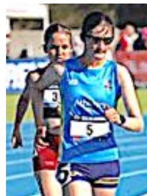
5000m action in Perth