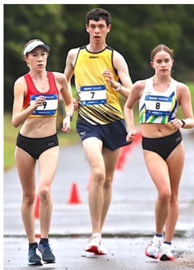
NSW Short Walks action.