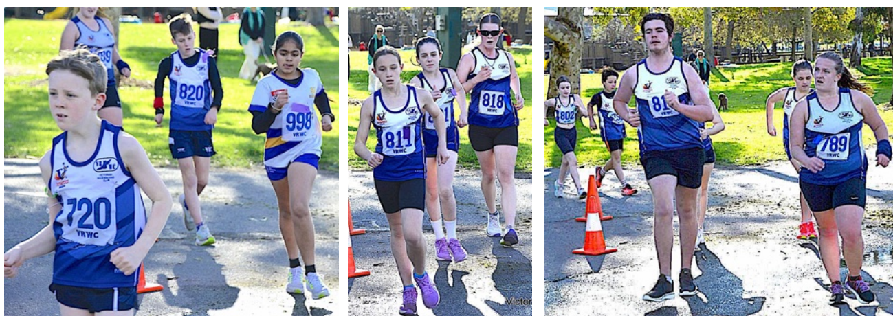
This race walking ... it really drives you 'round the bend!' 1