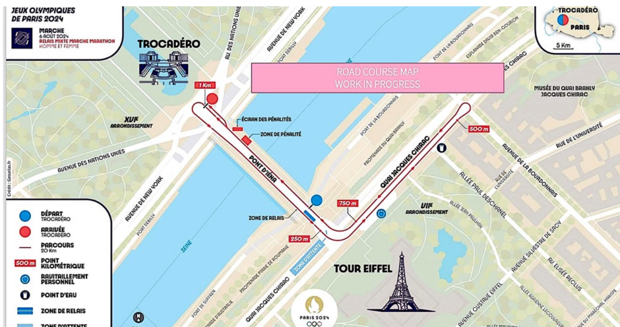
Olympic walks course map – as at 11 June.